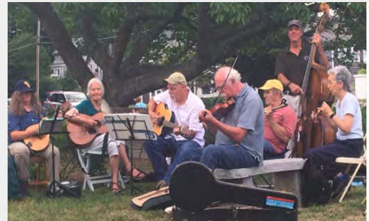
Pine Street Pickers

Bring your chairs or blankets and enjoy this free family friendly event!