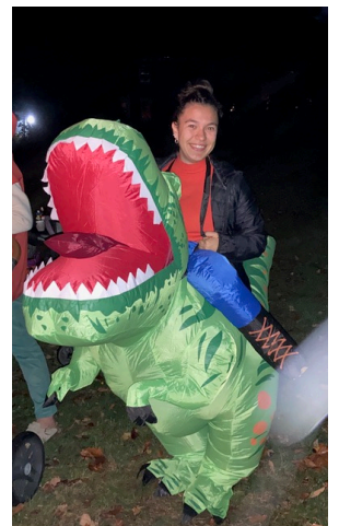
Gonna need a lot of candy...