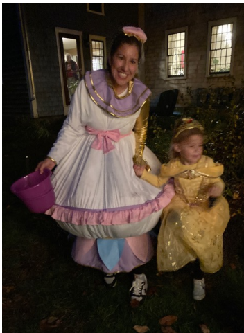
A royal treat awaits.

Old Main Road filled with trick-or-treaters during the evening of Oct. 31, 2022, all of them eager for treats (no tricks) as they paraded from the North Falmouth Congregational Church to the lawn of Bourget Law Group—where, as shown in the photo below, plenty of treats did indeed await.