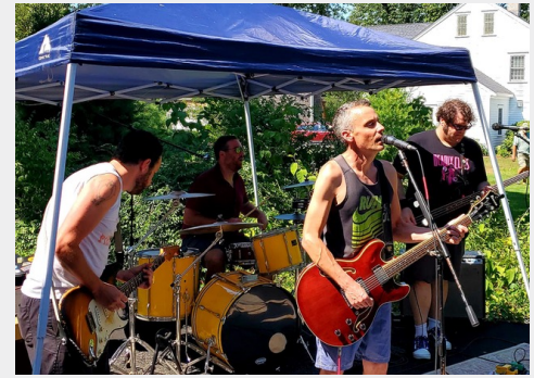
Local favorite Grasshopper Green played a mix of original pop-rock songs