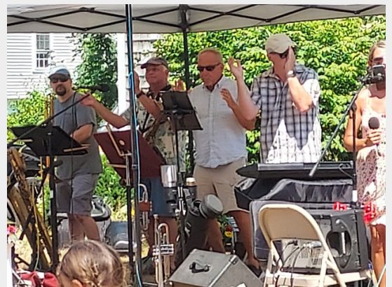
The horn section of Puffy Elvis had everyone clapping their hands.